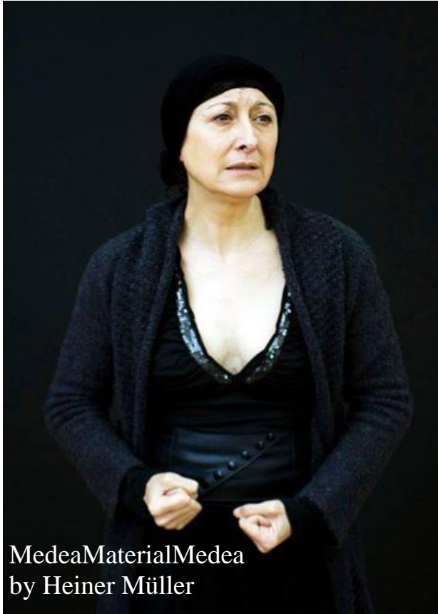
MedeaMaterialMedea by Heiner Müller