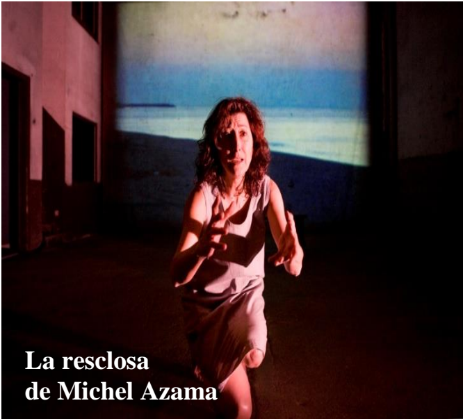
La resclosa de Michel Azama