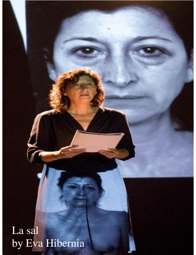
La sal by Eva Hibernia