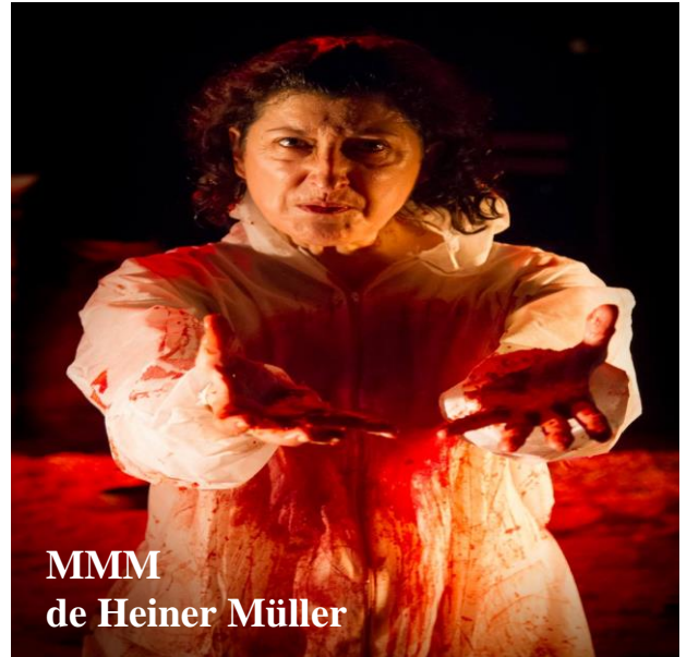
MMM de Heiner Müller